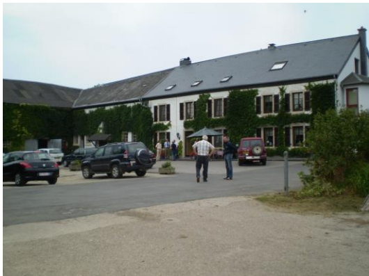
Nice ambiance at the Koob-farm