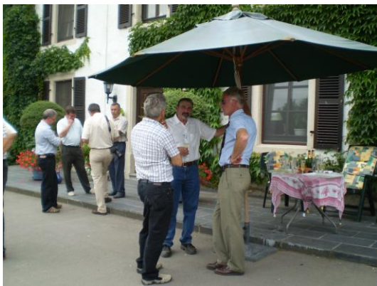
A pleasant break.