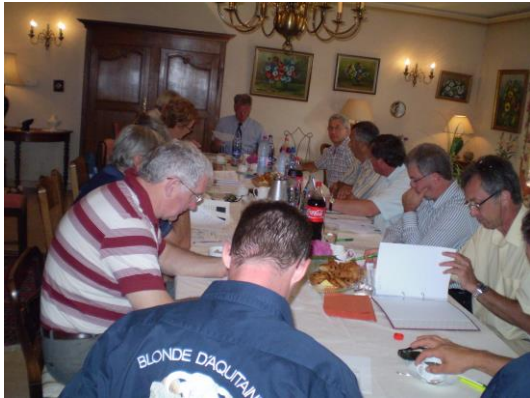
Heavy studying on proposals.