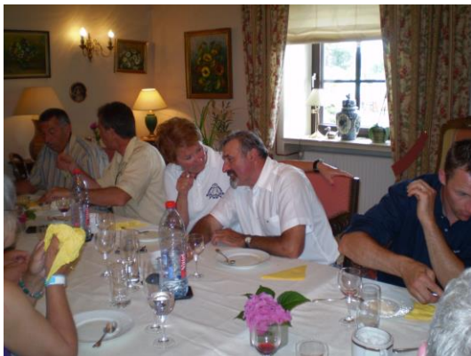
Discussions even at lunch-time.